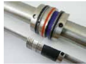
Crease & Perf

The creasing unit is supplied with either a fixed female or a bearing female.