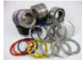
Full Multi-Tool Combo