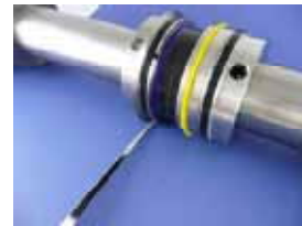
Crease & Cut