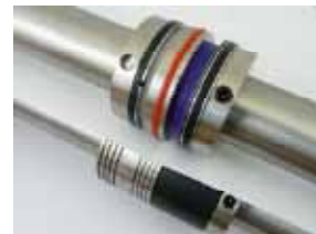
Crease & Perf