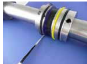
Crease & Cut