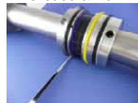
Crease & Cut