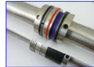
Crease & Perf

The creasing unit is supplied with either a fixed female or a bearing female.