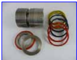
Creasing Cassette Parts Fixed Female shown at right