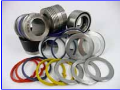
Contents of Combo Kit